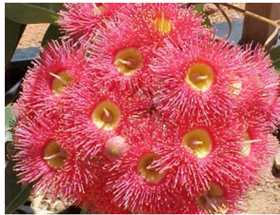
Floral Emblem Eucalyptus erythronema (Red Flowering Mallee)

The next meeting of Council will be an Ordinary Meeting to be held on Wednesday 17 th December 2014 commencing at 9.00am.